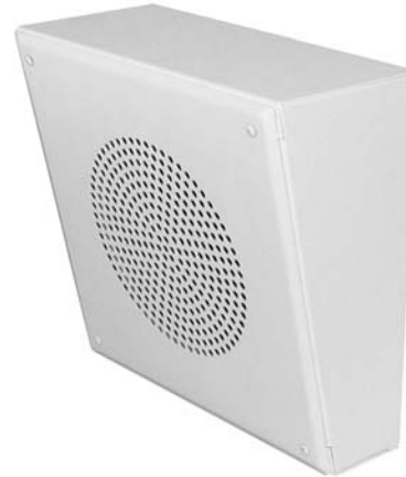
SYSTEM 2VP SHOWN