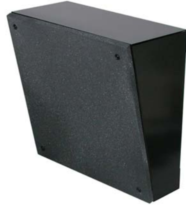
SYSTEM 4 Shown