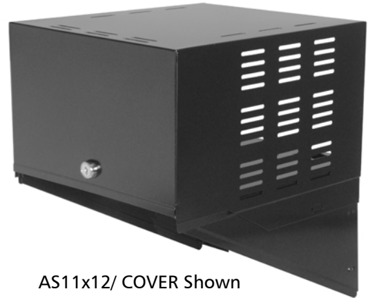
AS11x12/ COVER Shown